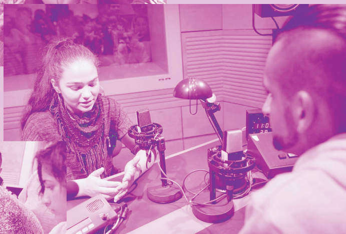
Members of choir Čhavoreng tried interview each other in Czech Radio