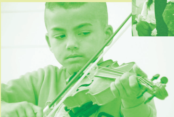
Artistic schiik in Bardejov, Slovakia