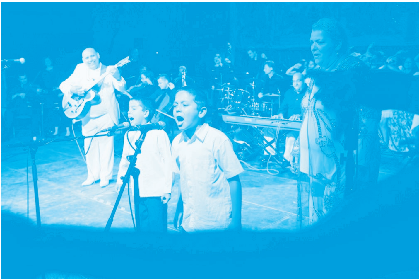
Concert in Roma settlement in Lenartov