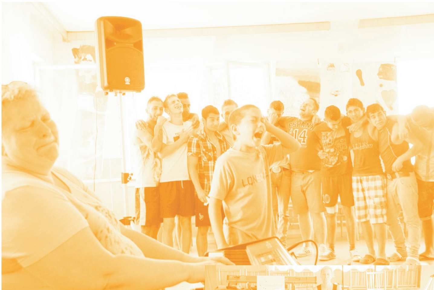
Joj – mammo expressional singing exercise