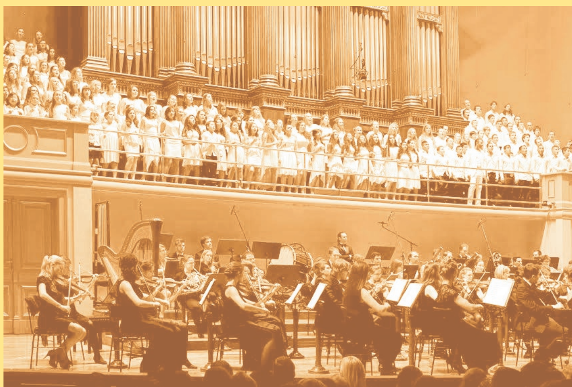
Čhavoreng and the others student choirs accompanied by Czech student philharmonic