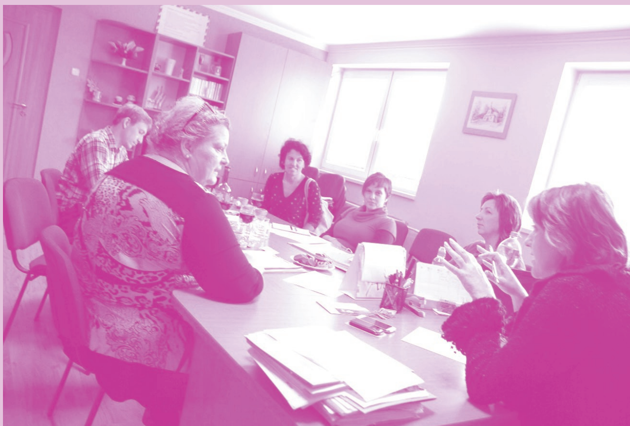
A meeting with mayors, Lenartov

18th – 20th February 2014 A meeting and collaboration on a Romano drom project took place with mayors of the villages where there are adjoining Roma settlements: Lenartov, Raslavice and Liptovský Mikuláš in the Slovak Republic.