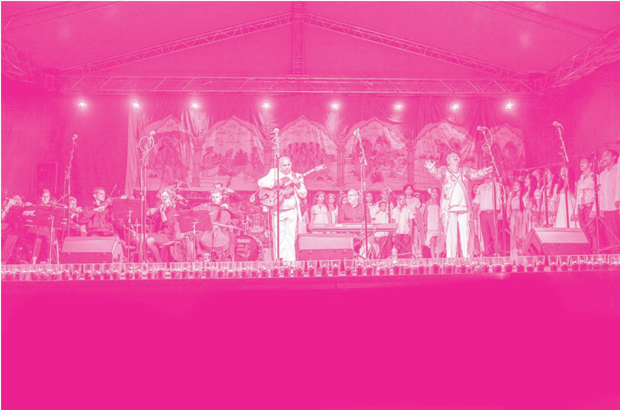
Concert in Roma settlement in Raslavice