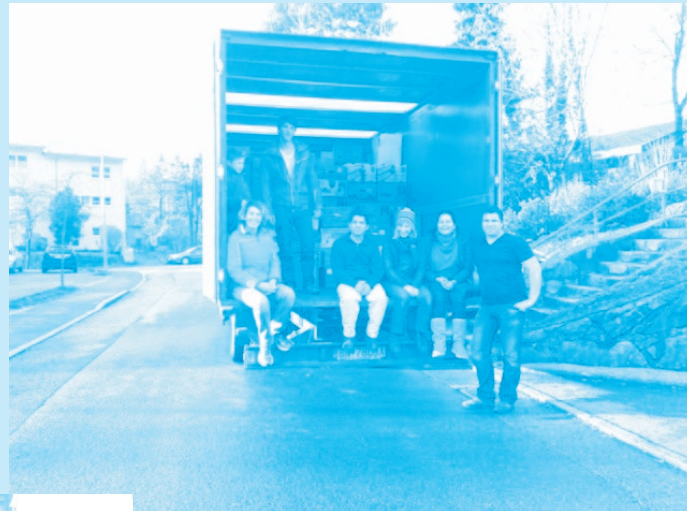
Parents of pupils of Montessori school in Ludesch