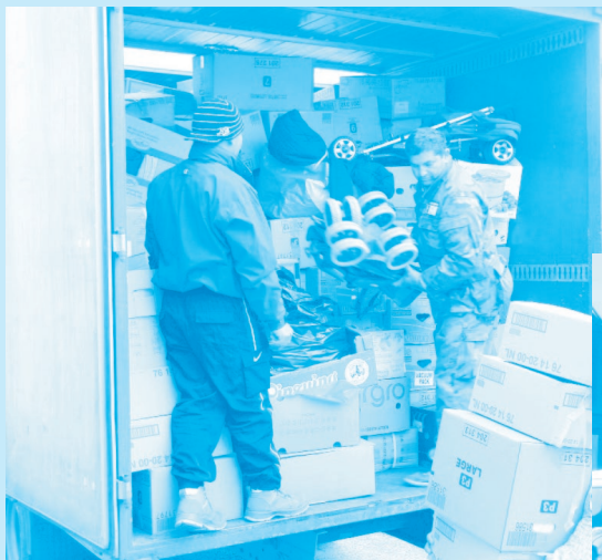
Acceptance of shipment in Lenartov