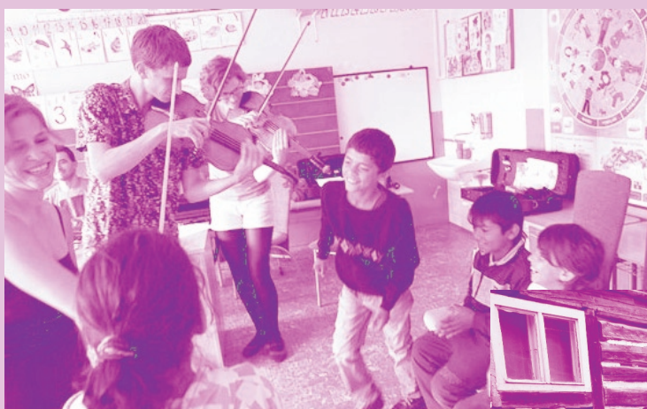
Musical workshop dedicated to Roma children from Roma settlement in Lenartov

Workshops were held on 6th August in the Roma settlement near Lenartov and on 7th August in the Roma settlement near Raslavice.